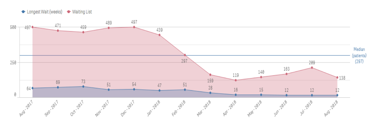
Graph 3 Running Waiting List Total & Longest Wait

#Data is from a Archive Waiting List by End of Month only (please refer to CAMHS - Waiting List for latest figures)