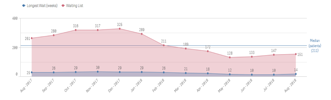
Graph 2 Running Waiting List Total & Longest Wait

#Data is from a Archive Waiting List by End of Month only (please refer to CAMHS - Waiting List for latest figures)