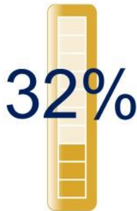
% Completion Rates by Audit Year

% of registered projects that have been completed