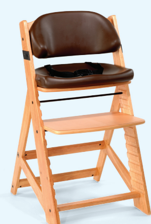
Special Tomato™ Height Right Chair Ages 0.5-15