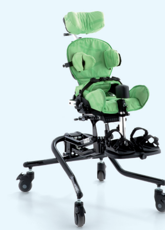
Squiggles Seat Ages 1-5