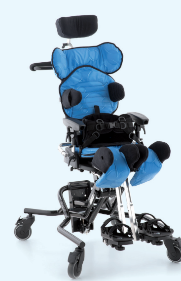
Mygo Seat Ages 3-14