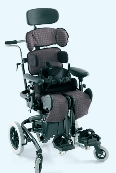
KIT Seat Ages 12-adult