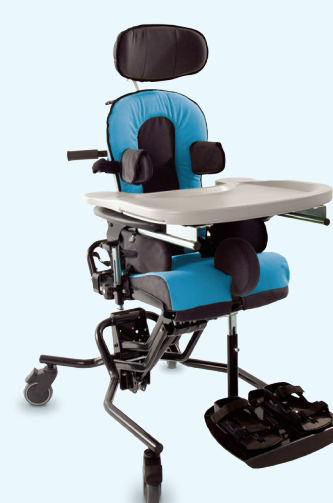
Everyday Activity Seat Ages 1-adult