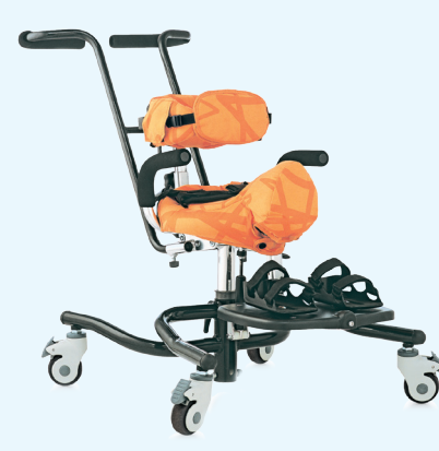
Saddle Seat Ages 1-5