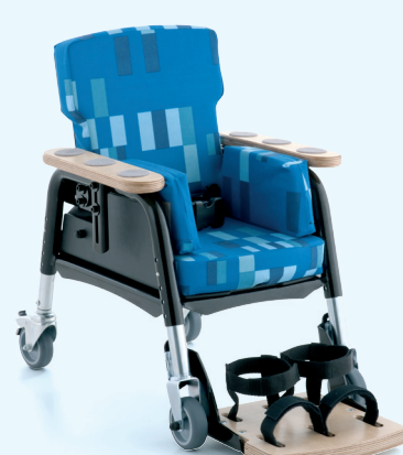
Easy Seat Ages 1-11