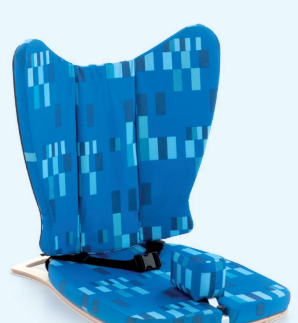
Corner Sitter Ages 1-14