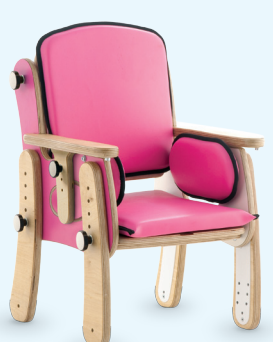
Pal Seat Ages 1-8