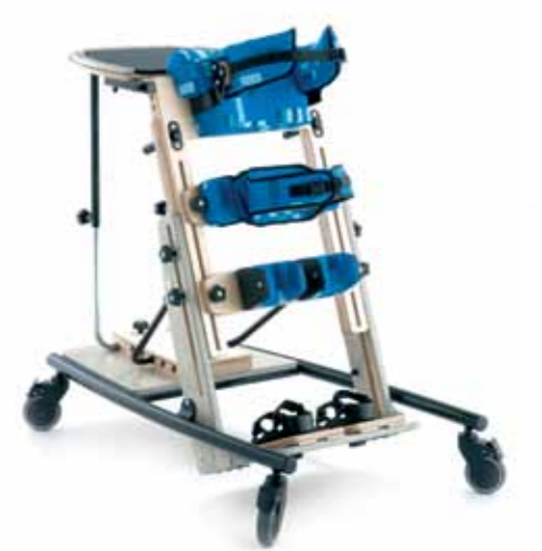
Pronestander Ages 1-18