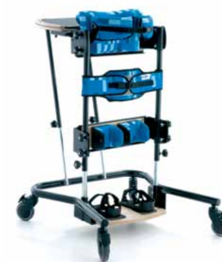
Freestander Ages 1-18