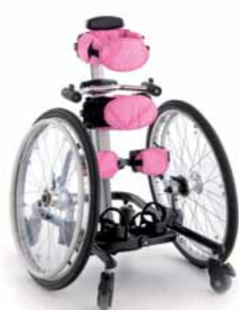
Squiggles Mobile Stander Ages 1-5