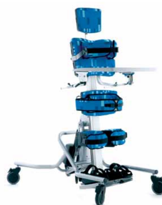
Horizon Stander Ages 4-18+