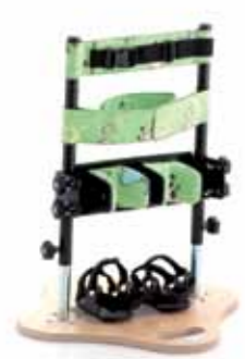
Totstander Ages 1-5