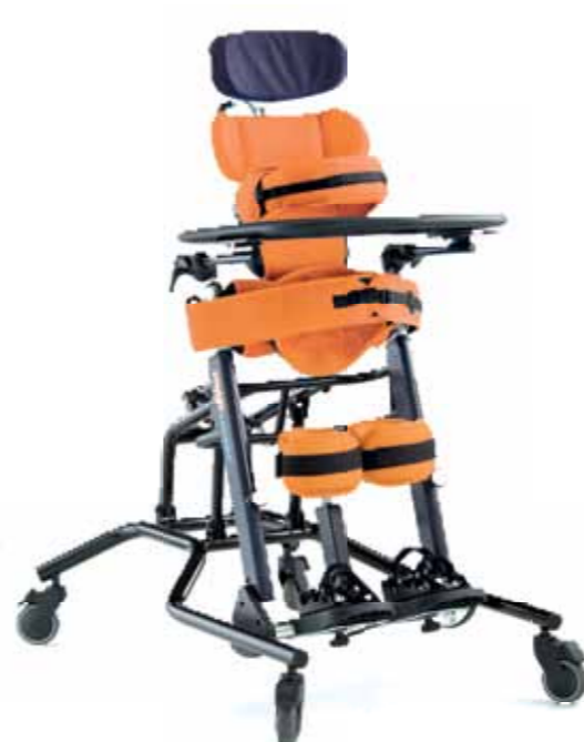
Mygo Stander Ages 4-14