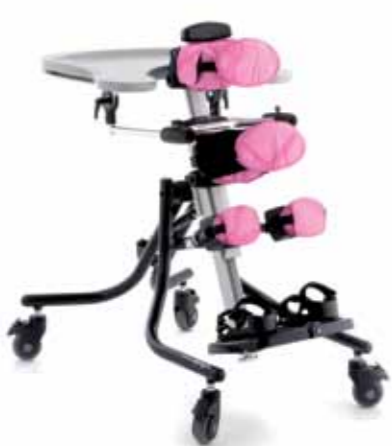
Squiggles Stander Ages 1-5