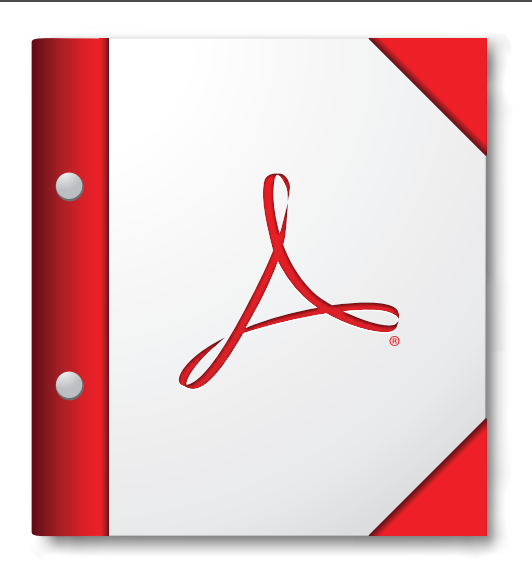
For the best experience, open this PDF portfolio in Acrobat 9 or Adobe Reader 9, or later.